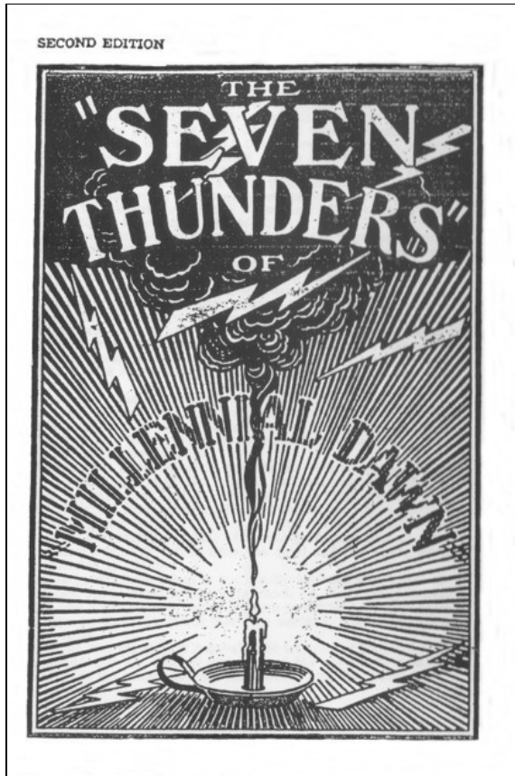
Front and back covers of THE SEVEN THUNDERS... (1928/1934)