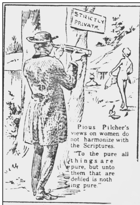
Consolation (Australian) January 10, 1940, p.4