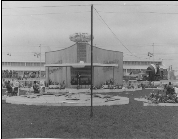
Speakers' platform at the 1969 Convention

The next international convention took place in Sydney, 1973. It attracted 34,000, and was noteworthy for a bomb hoax which stopped proceedings for several hours.